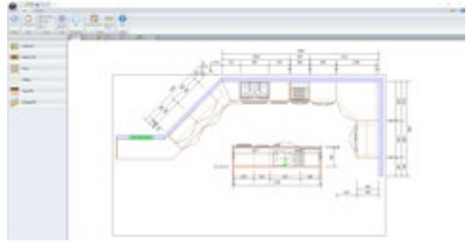
Easily layout your job, creating plans & elevation view to help communicate details of your project