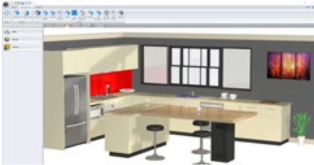
Produce realistic renders to present your designs to clients

MARKET LEADING SOFTWARE PROVIDING VALUE FOR BUSINESSES