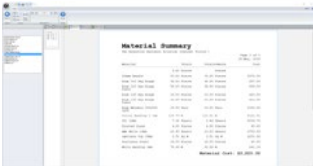
Produce a range of reports to give you the information you need out of your job