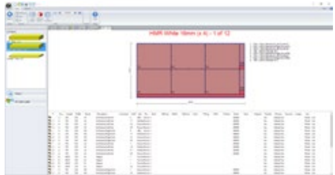
Produce Optimised cutting patterns to assist your saw operator and maximise material yield